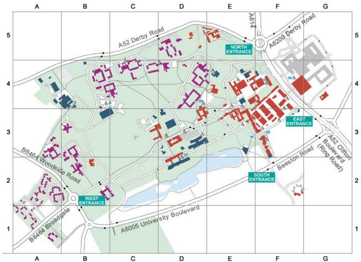
Figure E.1 University of Nottingham campus.

(Map based upon the 1991 Ordnance Survey Landranger 1: 10 000 scale plans with the permission of Ordnance Survey on behalf of the Controller of Her Majesty's Stationery Office, Crown Copyright. University of Nottingham, Licence number ED100017891)