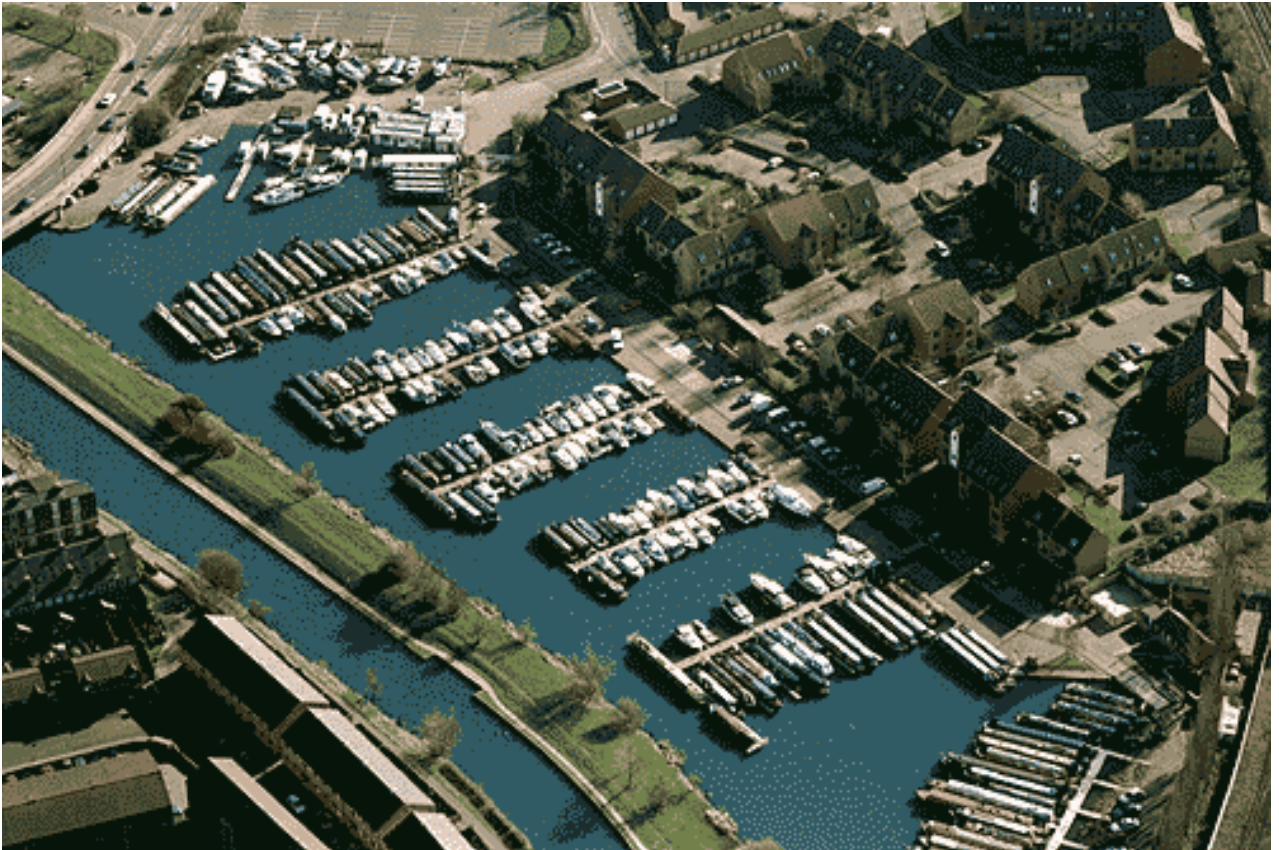
Figure E.2 Castle Marina

Table E.2 is based on entries in the NLPG plus two boats identified in the council tax file, Parfie and African Queen that are not included in the NLPG and so do not have UPRNs.