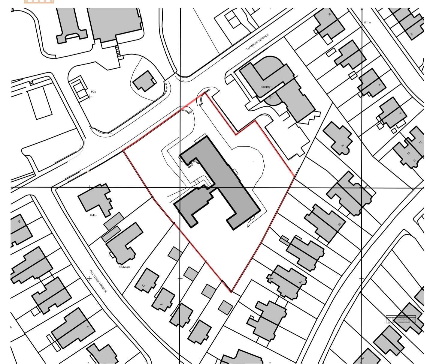
Location Plan, Scale 1:1250.

Rev D: 20.10.2016; Plots 4 and 5 file text corrected Rev C: 22.08.2016; Plots 04,05 parking swapper with plots 14 and 15 Rev B: 04.05.2016; Boundary at main entrance altered, Car parking allocation altered.