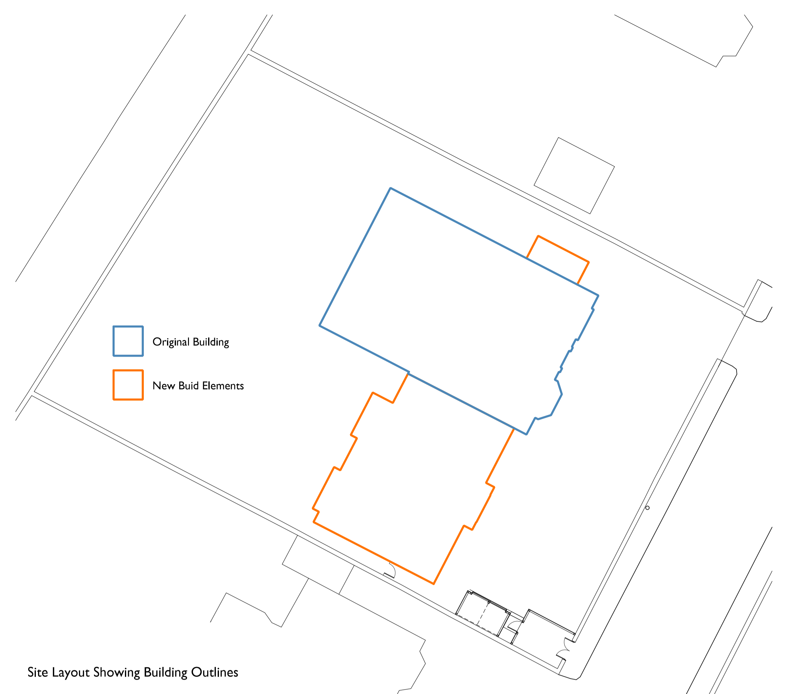
Site Layout Showing Building Outlines