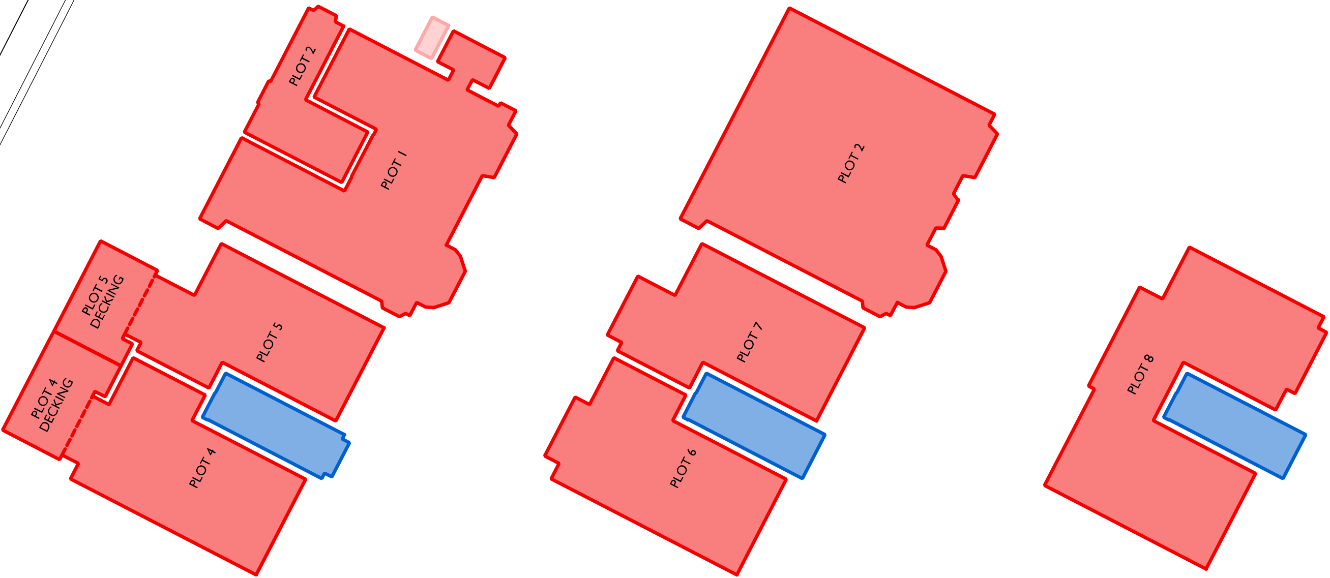
Ground Floor Flats