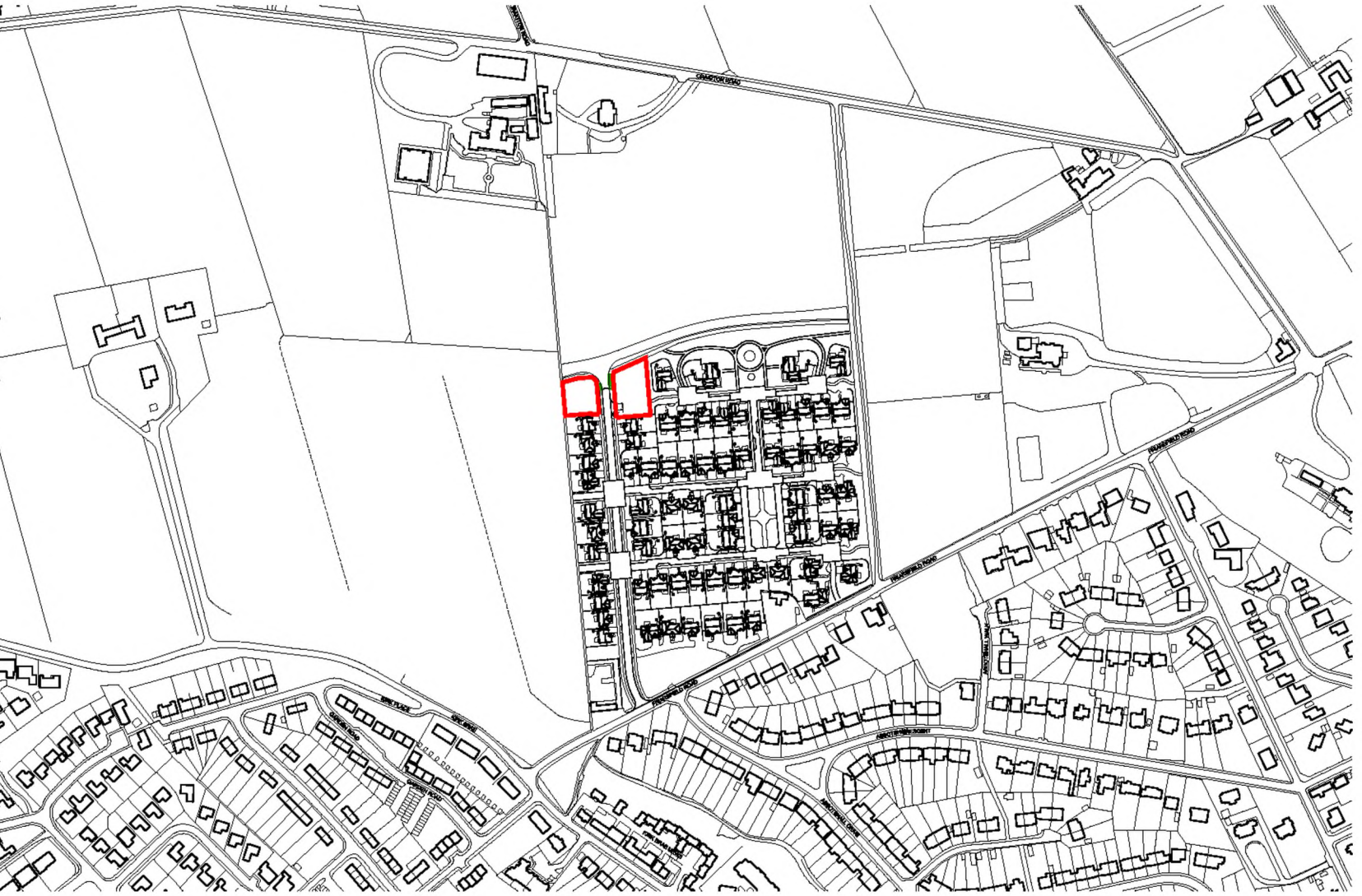
SITE LOCATION PLAN scale 1:5000 @ A1