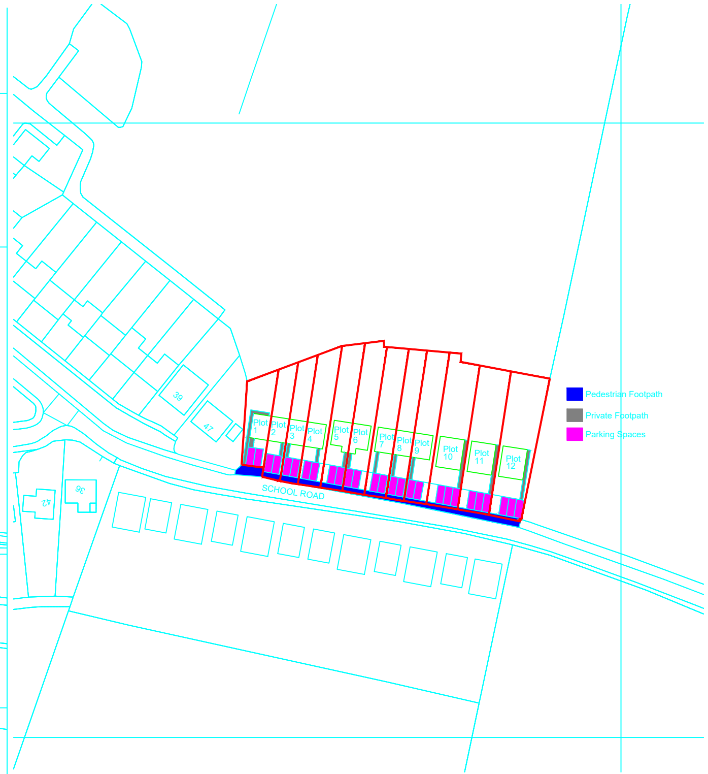
Proposed Location Plan 1:1250

The Development registered under title LAN20466 and plots 1 to 12 within have been DPA approved by: