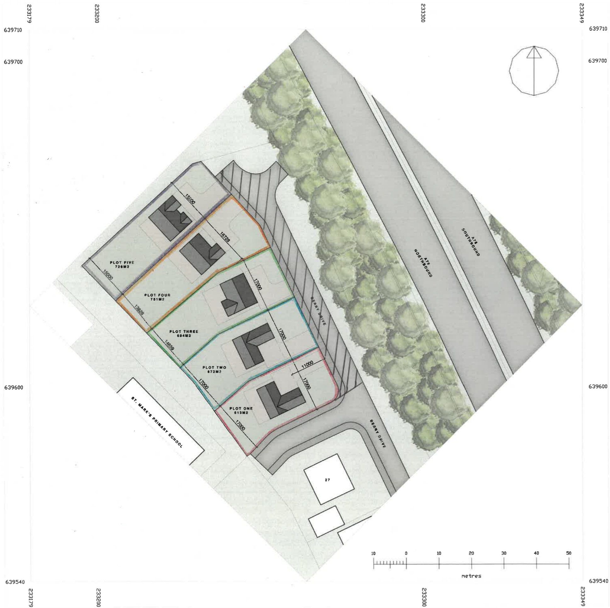
SITE PLAN SCALE 1/500