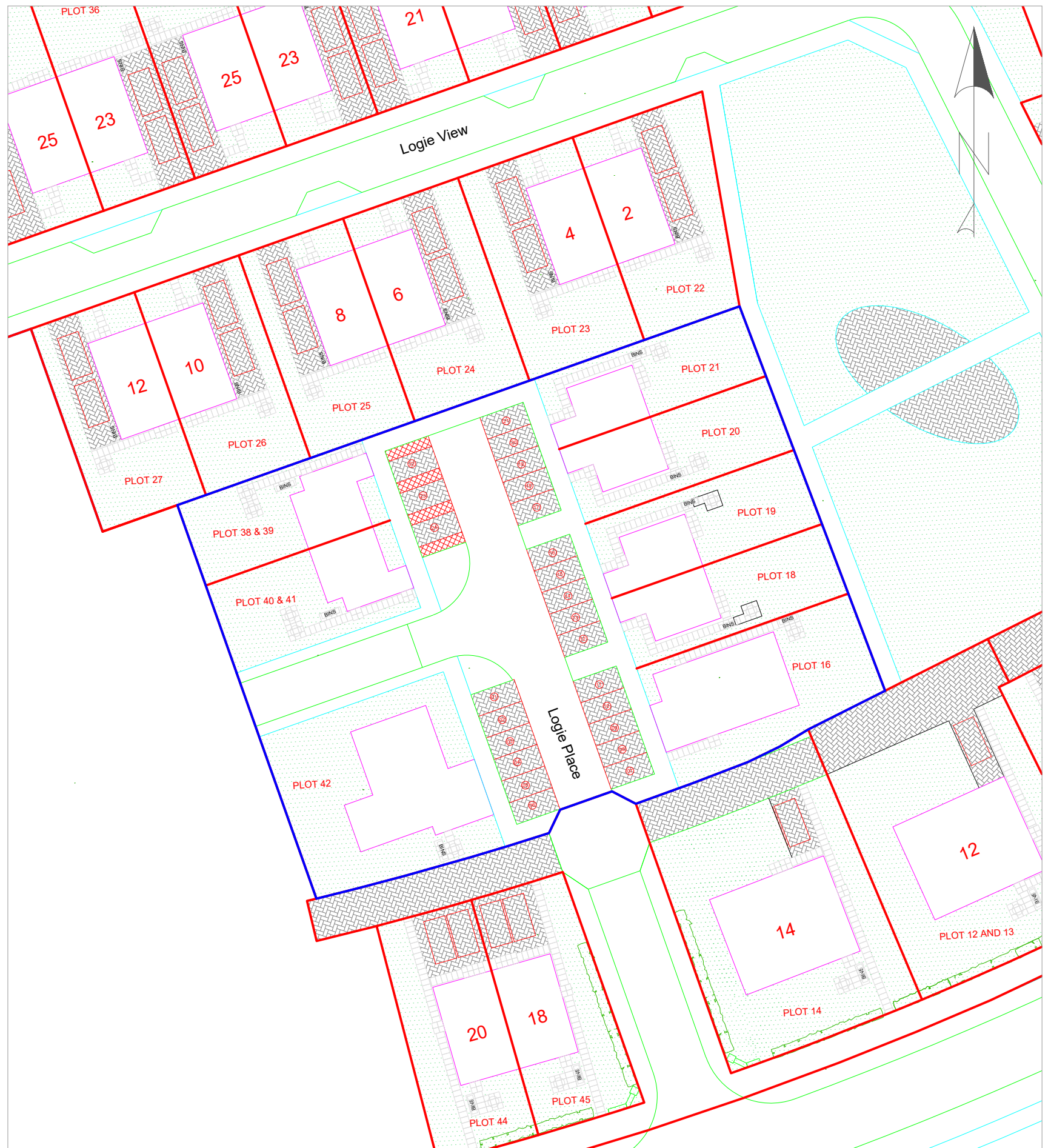
SITE PLAN | A3 | 1:500