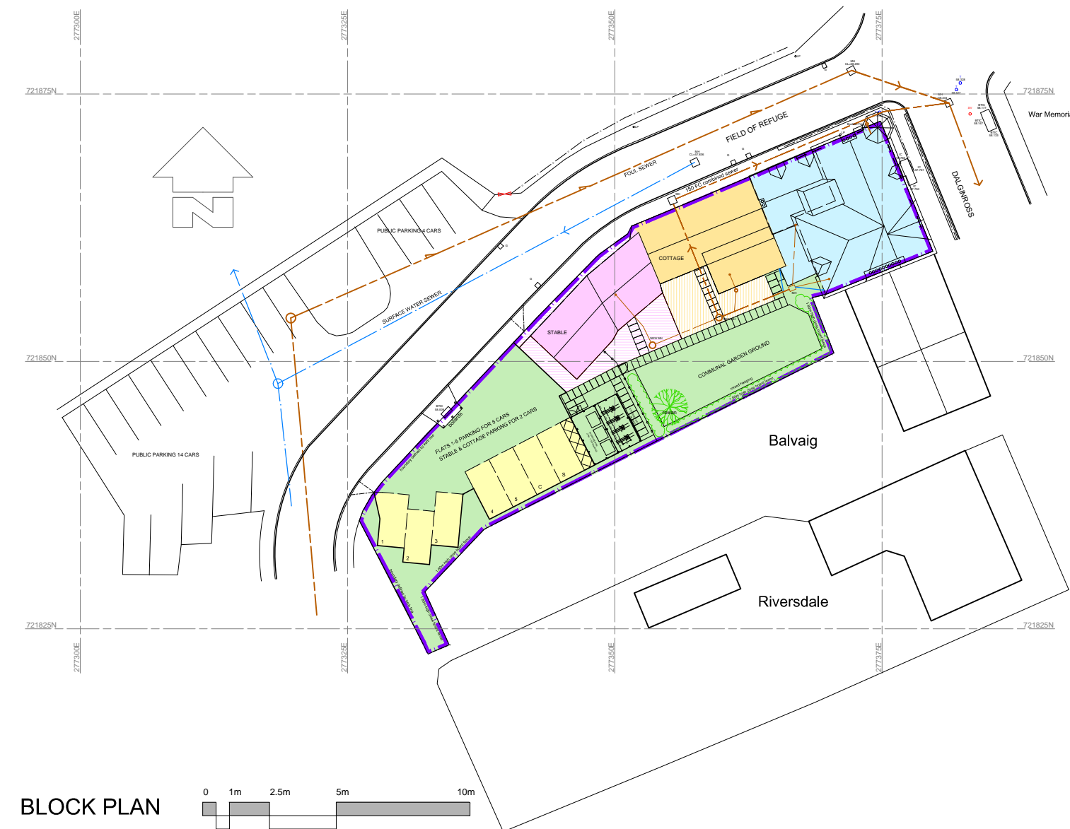
BLOCK PLAN scale 1:500

The Development registered under Title PTH55586 and all plots within have been DPA approved by: