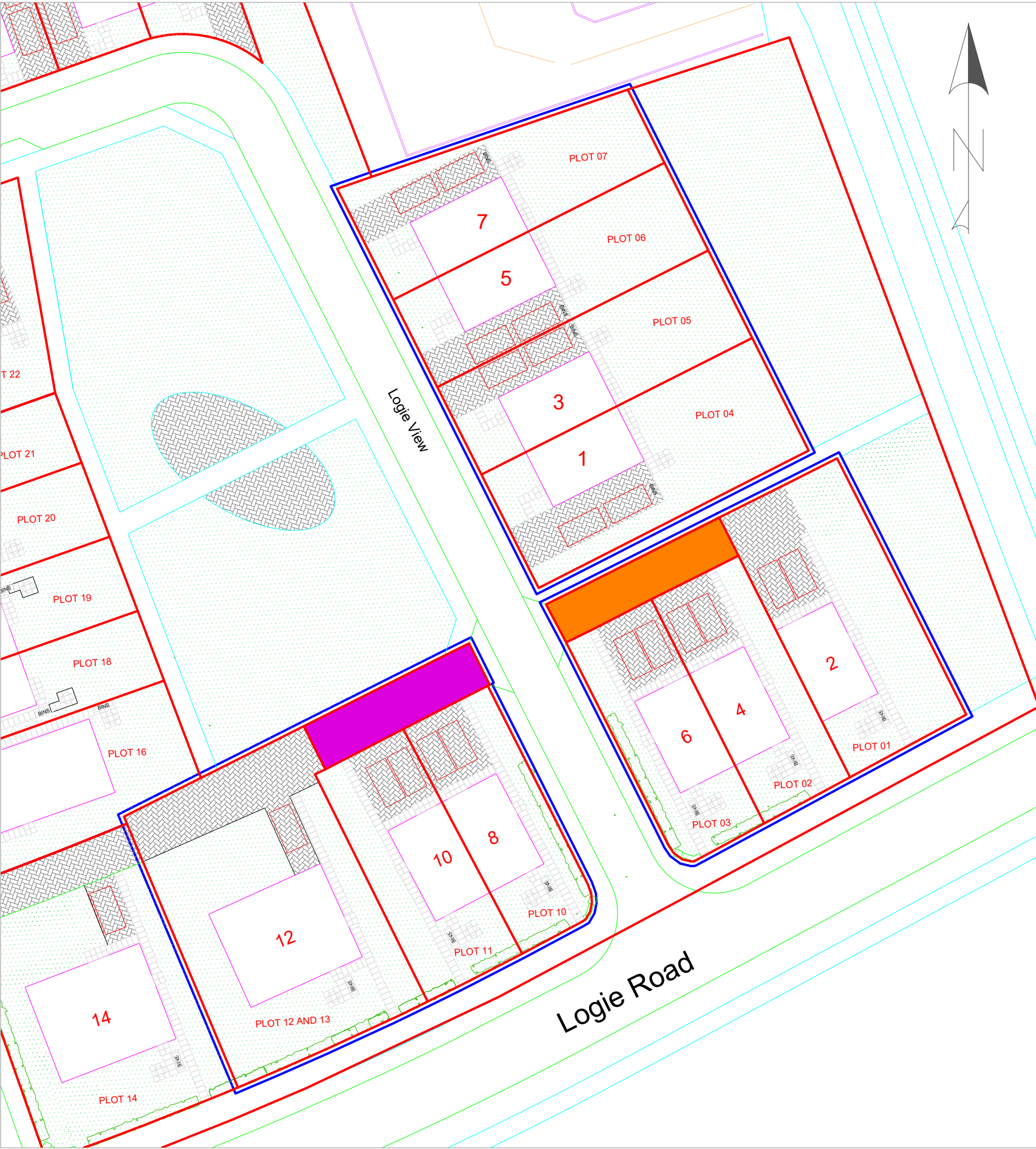
SITE PLAN | A3 | 1:500