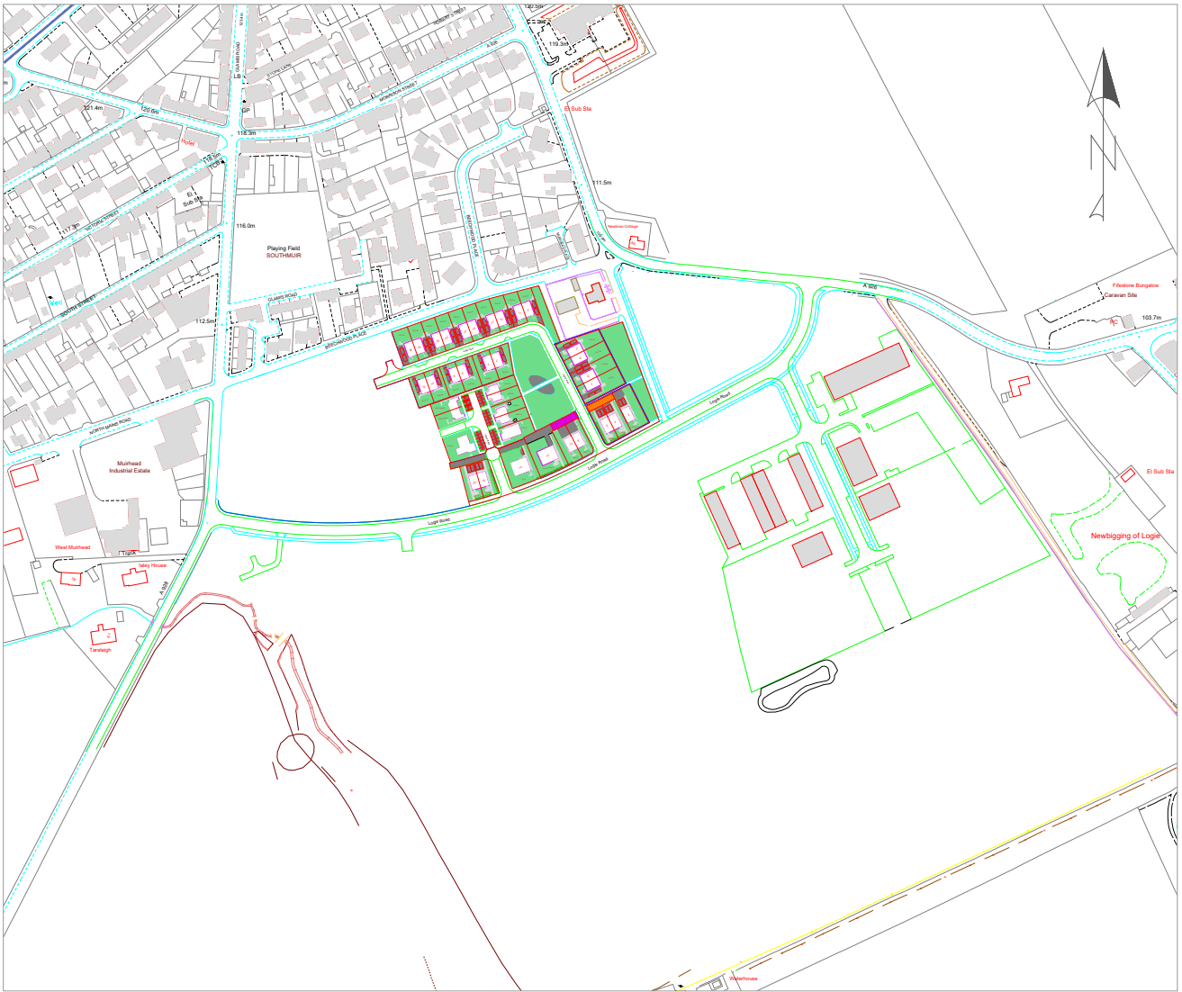
LOCATION PLAN | A3 | 1:5000