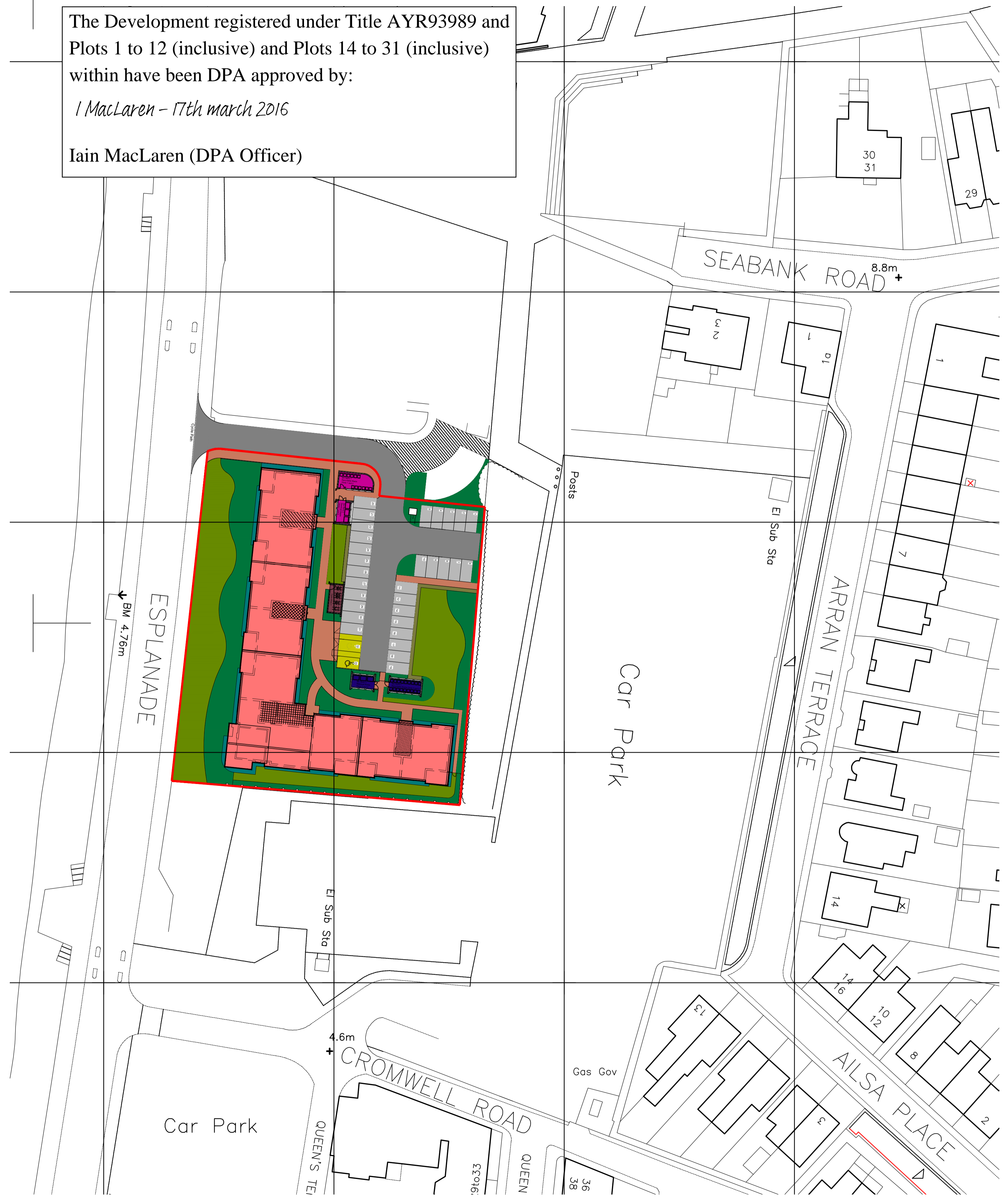
Site Plan as Proposed Scale 1:500