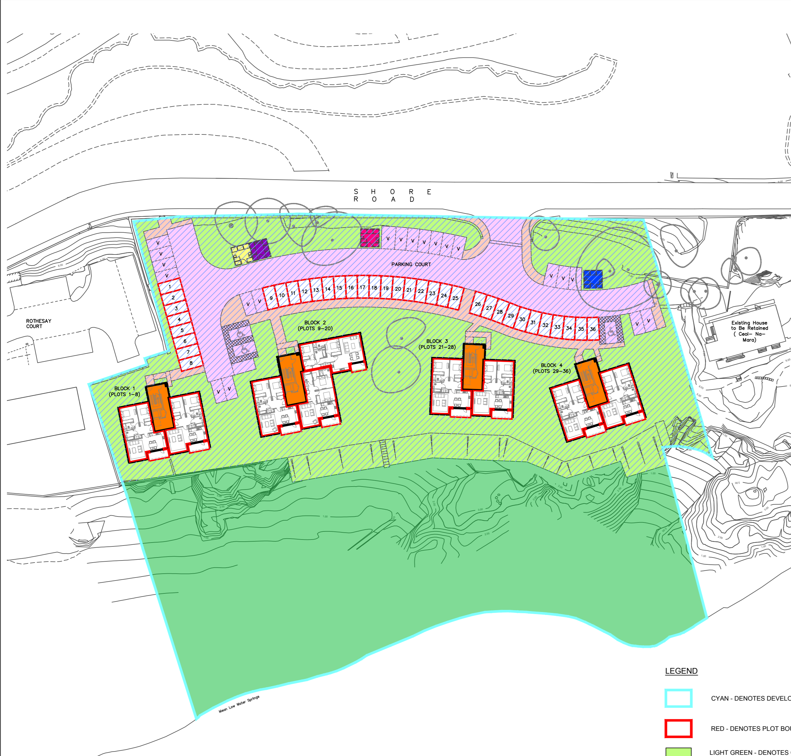
SITE PLAN (SCALE 1:500)

The development registered under title AYR62120 and plots 1 to 36 within have been DPA approved by: D MacDonald - 2 Feb 2021 David MacDonald (DPA Officer)