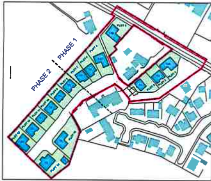
SITE BOUNDARY / PLOT & HOUSE TYPES