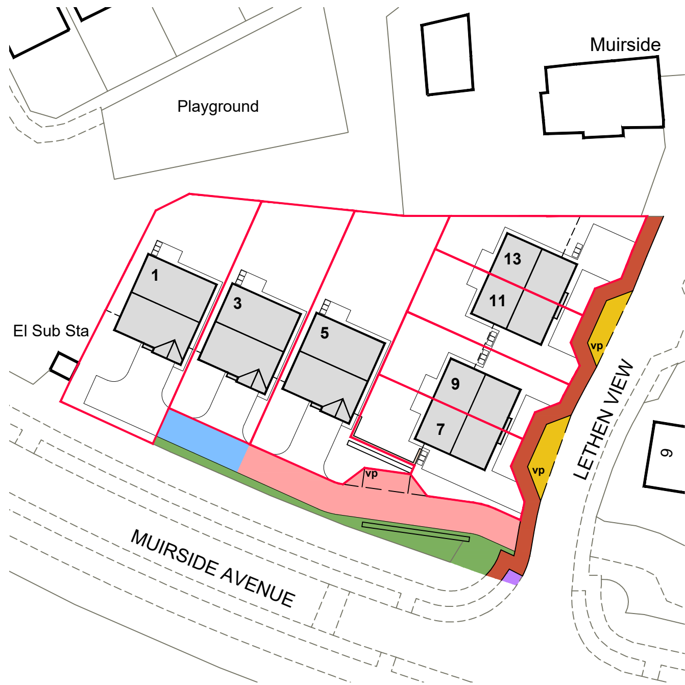
Overall Development Layout - 1:500