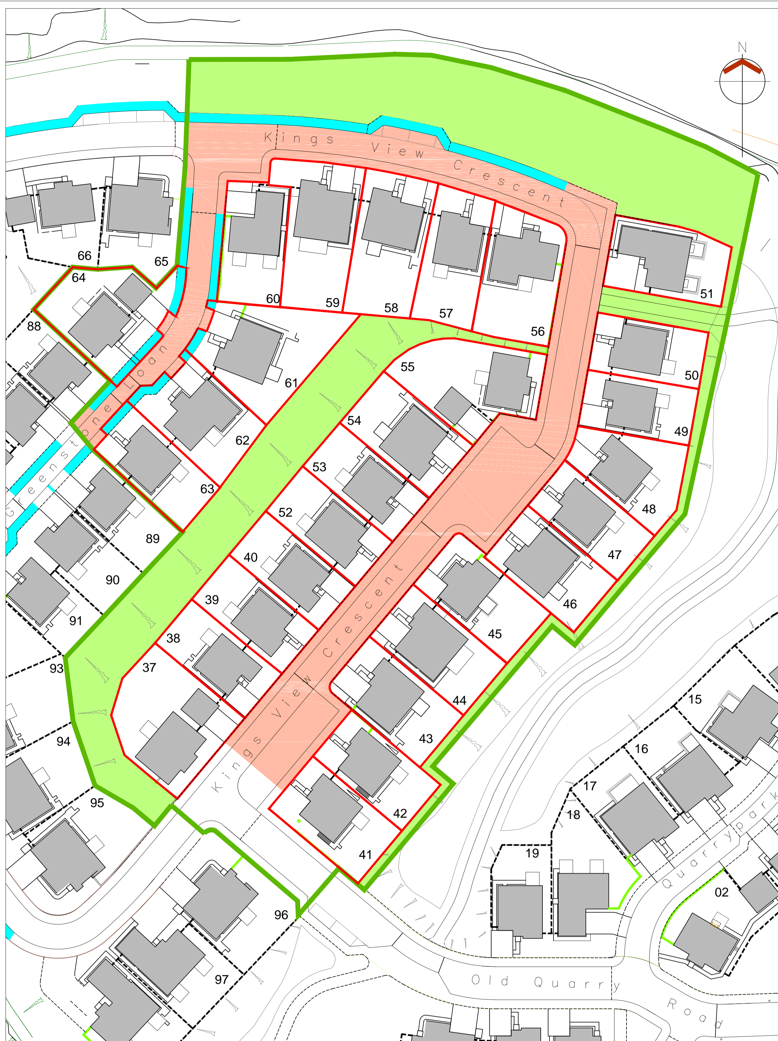
Site Plan 1:500

The Development registered under title MID168539 and plots 37 to 64 within have been DPA approved by: